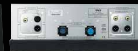
Main unit rear panel