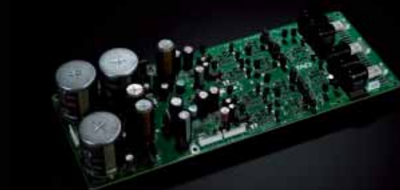
Audio output circuit

The performance of the I/V conversion circuit, which transforms the current output from the D/A converter to voltage, significantly impacts sound quality. The discrete I/V conversion circuit used in the D600 was developed to significantly lower noise and achieve a high slew rate. Together this results in a superior sound-stage presentation, improved rhythmic integrity and enhanced transient attack of the musical signal.