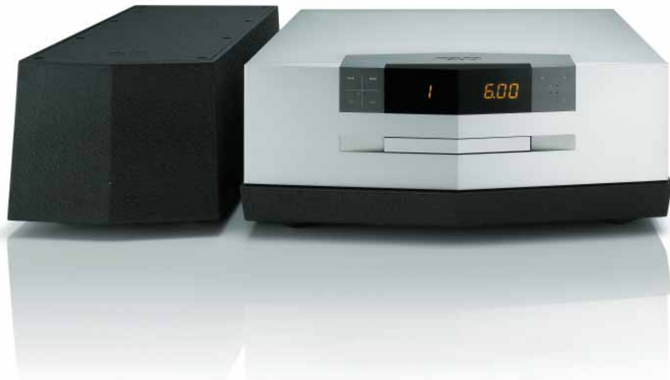
DISC PLAYER D600

TAD is a company that never compromises its design concepts and technologies. Our mission is to achieve a purity of sound to a degree that has never before been experienced. Introducing the TAD-D600. Backed by 30 years of professional audio experience, this new reference standard disc player inherits the TAD spirit of continuous evolution and refinement. Its core technology, an Ultra-high-Precision Crystal Generator master clock (Master Clock UPCG) provides an ultra-high clock to noise ratio (Ultra-high C/N) achieving incomparably accurate D/A conversion performance. With this innovative technology, the D600 begins a new era in music reproduction - music unaltered from the original recording and true to the performance.