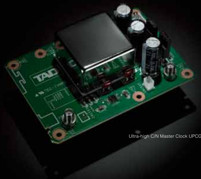
Ultra-high C/N Master Clock UPCG

The D600 employs a new proprietary crystal oscillator that improves noise level more than 50dB compared with conventional players, attaining ultra-high C/N characteristics. TAD focused specifically on C/N in order to provide the most accurate sound reproduction capability, aiming to thoroughly reduce jitter in the low frequency sideband ranges relative to the center frequencies. TAD developed the crystal oscillator in co-operation with a crystal manufacturer. Based on technologies developed for high-speed digital base station relay facilities this produces an oscillator perfect for the D600.