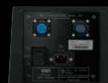
Power supply rear panel