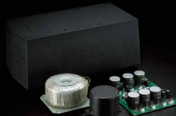
High capacity power supply

In order to stably support the heavy chassis and block transmission of vibration from below, the D600 is equipped with die-cast aluminum three-point support spikes. This extremely stiff suspension thoroughly dampens any vibration that would otherwise be transmitted upward from the support surface. The D600 provides high-quality sound reproduction from the feet up!