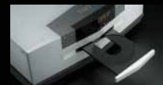
Aluminum disc tray

Realizing the ultimate in reproduction accuracy also required an innovative design for the CD/SACD mechanism. It features high stiffness, smooth operation and superior vibration control properties thanks to a precise loading mechanism equipped with metal shaft bearings. The pickup employs an infinite conjugate optics system, ensuring both stable operation and high reading precision. The highly-rigid disc tray is formed from precision-machined aluminum to further minimize vibration. A black sheet on the tray both restricts the scattered reflection of laser light to increase reading precision and contributes to vibration control.